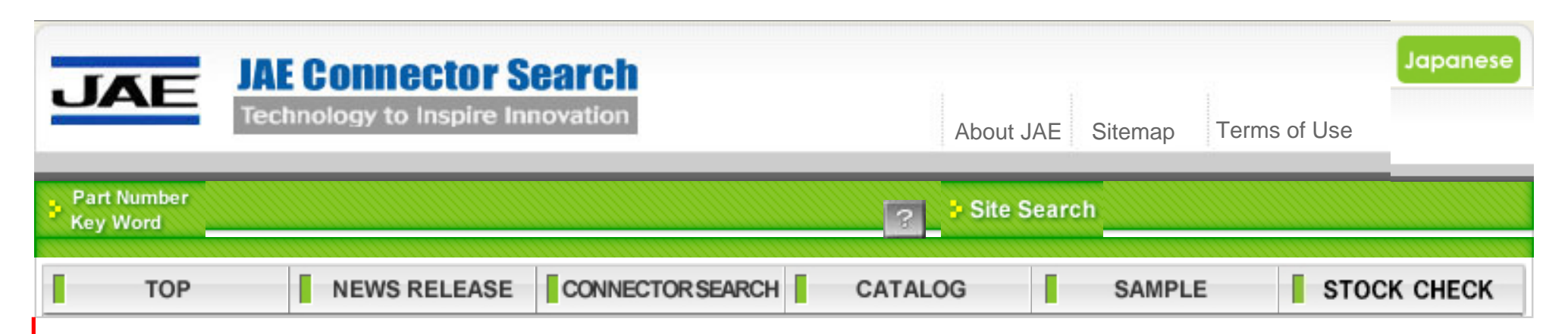
TOP > WR-80S-VFH05-N1